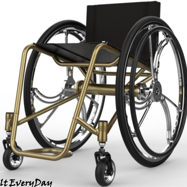
Adult EveryDay Wheelchair